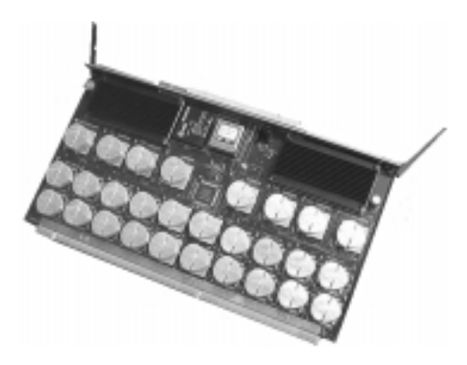
Figure 2 Heatsinks mounted to printed circuit board

Heat sinks are most commonly made by these following methods: extruding, used most often in higher powered and amplifier type cooling; stamped, used in low power discrete component cooling; and machined, used in medium powered discrete component cooling, especially high value items like processors. This paper will focus on