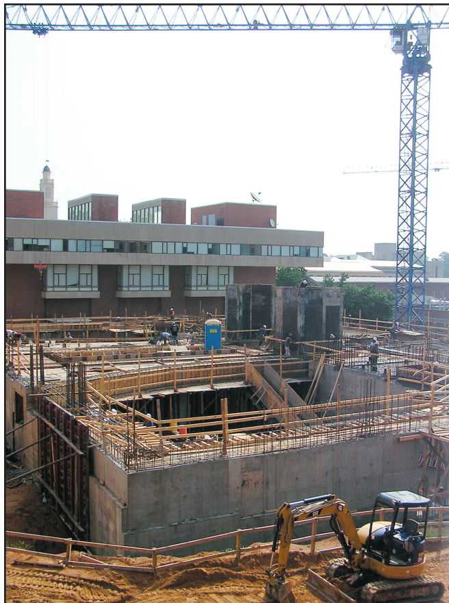
Construction on Phase I of the Science Complex, as seen behind Sitterson Hall, is well underway.

Non Profit Org US Postage PAID Permit 177 Chapel Hill NC