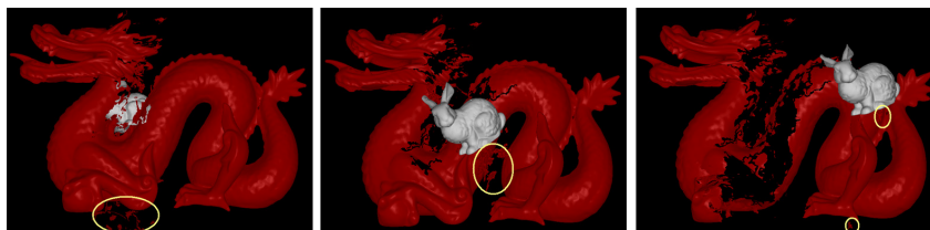
Environment with breakable objects: As the bunny (with 35K triangles), falls through the dragon (with 250K), the number of objects in the scene (shown with a yellow outline) and the triangle count within each object changes. The collision detection algorithm computes all the overlapping triangles during each frame. The average collision query time is 35 msec on a PC with an NVIDIA GeForce FX 5900 GPU.

The algorithm has been implemented on a PC with a commodity graphics processor such as the NVIDIA GeForce FX 5900 Ultra graphics card. The resulting system has been applied to different environments composed of a high number of moving objects. These include breaking objects, cloth simulation and deformable models. The algorithm is able to compute all the overlapping primitives in a few milliseconds. The results of this research were presented at ACM/Eurographics Graphics Hardware 2003, ACM SIGGRAPH 2004 and ACM VRST 2004. The GAMMA group has also designed GPU-based algorithms for distance field computation, path planning, database operations and fluid simulation. More details about these projects are available at: http://gamma.cs.unc.edu/hardware/index.shtml .