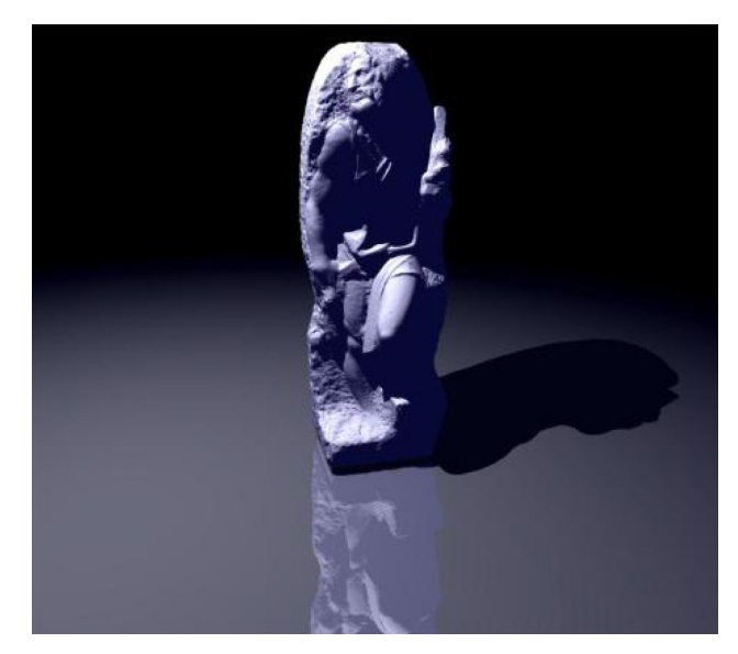
128 million triangle St.Matthew statue rendered at interactive frame rates using our R-LOD approach

Logarithmic ray tracing behavior as the complexity (in millions of triangles) of the same model increases. When the size of the geometry and hierarchy exceeds main memory, rendering time increases drastically.