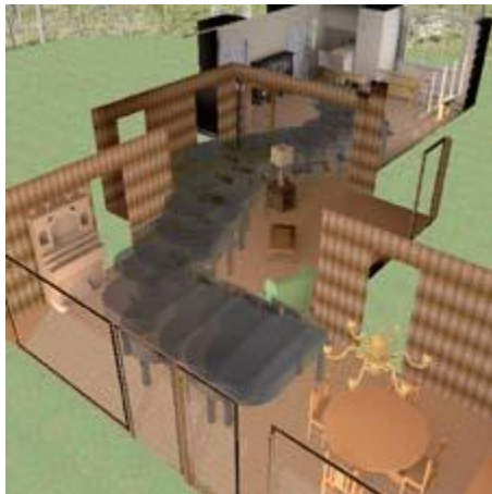
Motion Planning. A piano avoids moving furniture as it navigates through a cluttered house.

A key challenge of motion planning is the difficulty of converting 3D representations of the robot and the environment into a characterization of the higher dimensional (6D or higher) space of possible positions and orientations. Previous approaches that have worked well in practice use probabilistic roadmap algorithms, but problems arise when the robot needs to move through "narrow passages"--constricted portions of the environment--because it is unlikely that a sufficient number of configurations can be generated randomly in these narrow passages.