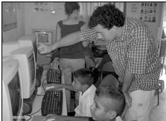
Volunteers from TWB teach typing skills to elementary school children in Matamoros, Mexico. The goal of TWB is to establish a sustainable computer lab in a different developing community every year.

For more information on Technology Without Borders, please visit studentorgs.unc.edu/twb