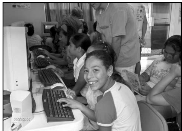
This computer lab was set up as a free center for teaching job-based computer skills, and is the only free source of computer education for students within three counties.