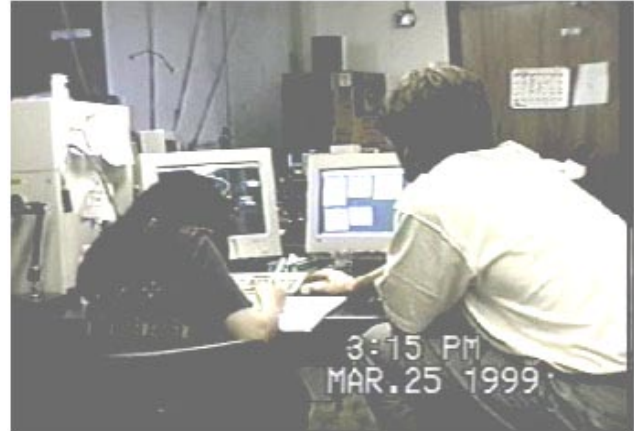
Study participants collaborating in the same location.

We first conducted an ethnographic study of how scientists collaborate when they are face to face. Thirty observations and twenty-six interviews were conducted with the physical