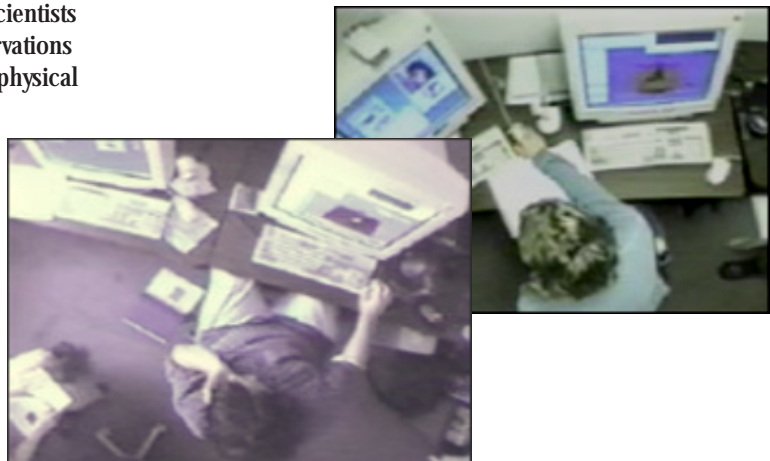
Study participants collaborating distributively.