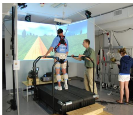
Dual-belt treadmill and three screen VE system in the Human Motion Science laboratory.