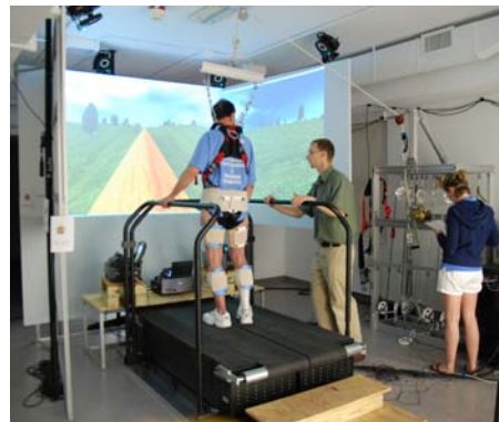
Dual-belt treadmill and three screen VE system in the Human Motion Science laboratory.