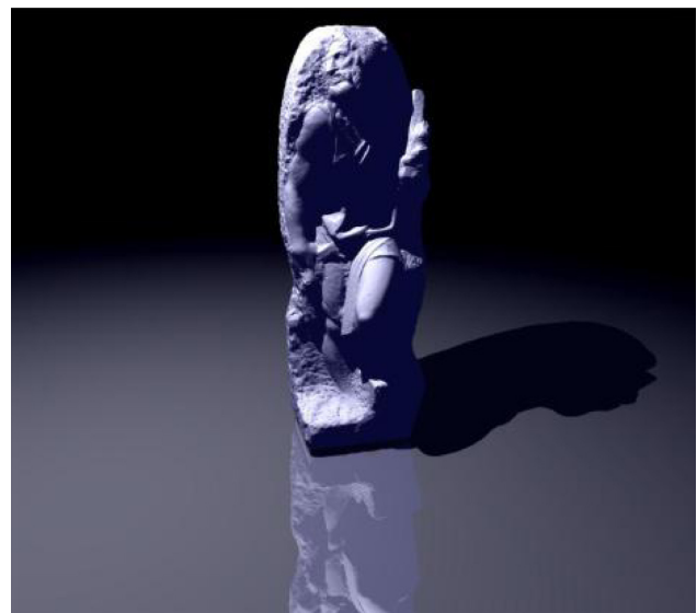
128 million triangle St. Matthew statue rendered at interactive frame rates using our R-LOD approach

Logarithmic ray tracing behavior as the complexity (in millions of triangles) of the same model increases. When the size of the geometry and hierarchy exceeds main memory, rendering time increases drastically.