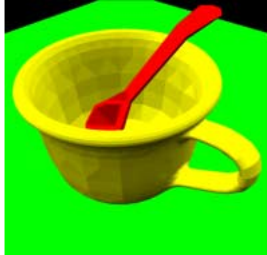
A frame from a dynamic simulation of a spoon falling into a cup.

Web: gamma.cs.unc.edu/SWIFT++ gamma.cs.unc.edu/SWIFT gamma.cs.unc.edu/collide