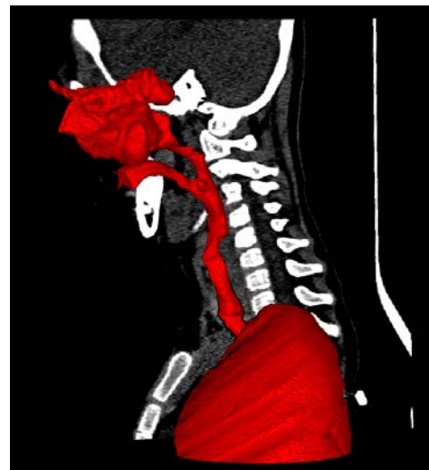
Fast, threshold-based segmentation of the airway. This segmentation includes portions of the lungs.

CT scanners produce images with high contrast between air and tissue, making segmentation of the airway structure fairly straightforward. VPAW provides two segmentation algorithms, an automated method that uses morphological operations to limit the segmentation to the nostrils and a faster threshold-based algorithm that requires user input to specify a point within the airway and the location of the nostrils. Segmentations produced by external programs may also be imported.