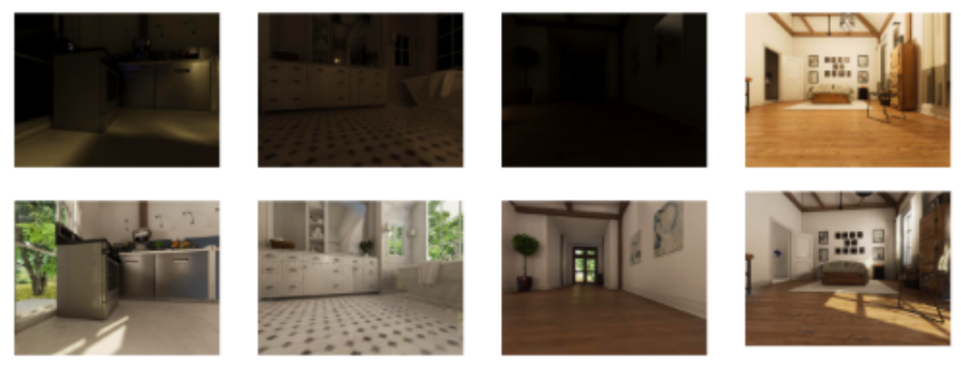
Figure 2. Validation images from PODC.

bilistic bounding box outputted by the detector. Essentially, assigning higher probabilities to pixels that belong to the object as foreground improve the score, and including any background pixels outside of the ground truth bounding box hurt the score.