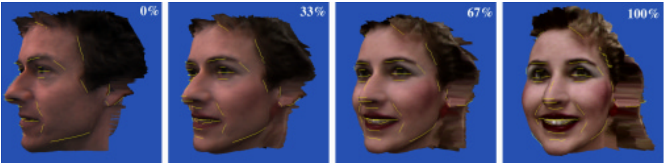
Plate 3. Metamorphosis of surface shapes in 3-space: 0%, 33%, 67%, and 100% versions of the David -> Heidi sequence.