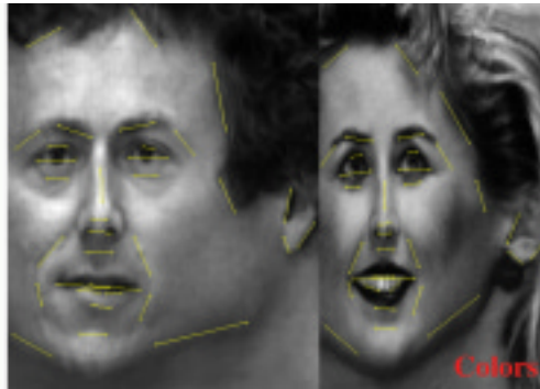
Plate 2a. Line segments define similar features in two parametric models of human heads. The grayscale background image represents surface color.