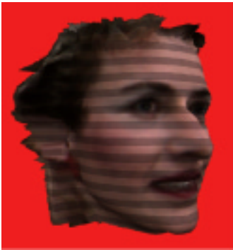
Plate 1. Parallel 2D-3D morphing. Each stripe is processed on a different computing node.