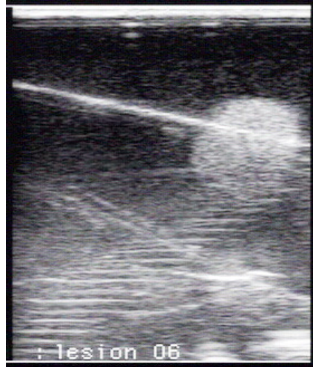
Fig. 4. Lab view (left) and ultrasound image (right) while the physician, wearing the Glasstron-based AR HMD, performs a controlled study with the 2000 AR system. She holds the opto-electronically tracked ultrasound probe and biopsy needle in her left and right hands, respectively. The HMD view was similar to Figure 3