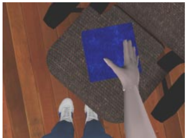
Figure 4. View showing avatar.

Several researchers have undertaken the quantification of presence [Slater, 1994; Ellis, 1996; Pausch, 1997]. Subjective reporting using questionnaires is the most common method. This method, however, relies on eliciting responses about subjects’