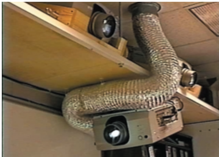
2 Greg's projectors.

To further enhance our ability to change positions, we moved our keyboards to more flexible supports. Gary uses an articulated keyboard arm that instantly adjusts for use while sitting or standing. Greg uses a small, rolling, wooden table that adjusts for height and tilt.