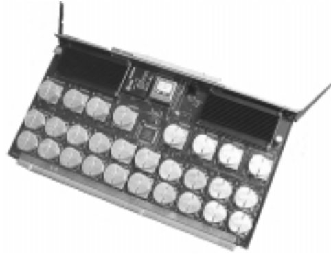
Figure 2 Heatsinks mounted to printed circuit board

Heat sinks are most commonly made by these following methods: extruding, used most often in higher powered and amplifier type cooling; stamped, used in low power discrete component cooling; and machined, used in medium powered discrete component cooling, especially high value items like processors. This paper will focus on