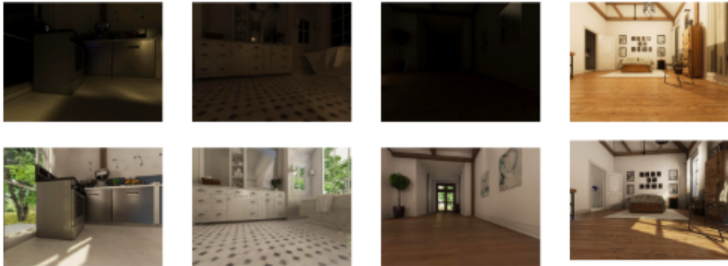
Figure 2. Validation images from PODC.

bilistic bounding box outputted by the detector. Essentially, assigning higher probabilities to pixels that belong to the object as foreground improve the score, and including any background pixels outside of the ground truth bounding box hurt the score.